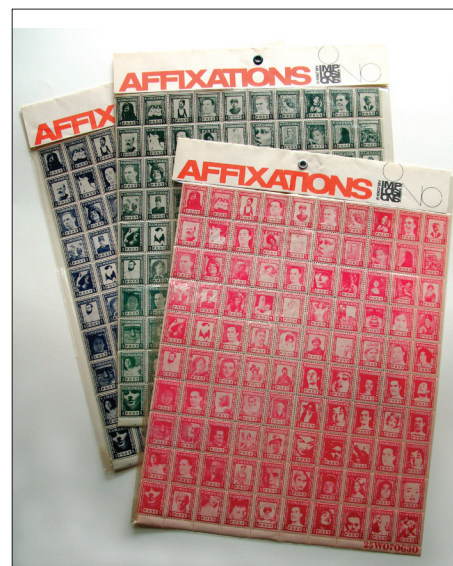
Affixations stamp sheets packaged for Implosions, Inc., 1967.